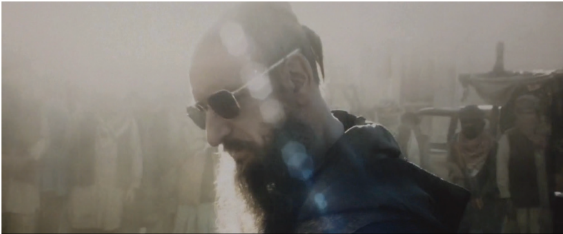
Figure 2. The Mandarin walks through a crowd of men in turbans and scarves holding AK-47s (1st Mandarin video).

In the film's development of the modern Mandarin's image, a fictionalized reel of jihadist propagandais shown which includes what appears to be actual shots from Osama bin Laden-era al-Qaeda films, likely taken at the al-Farouq training camp near Kandahar before June 2001.