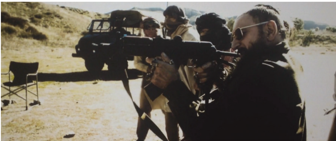
Figure 3. The Mandarin fires an AK-47 next to men in turbans and scarves (2nd Mandarin video).

This seamless mixing of the historical (i.e., ~2001 bin Laden footage) and the fictional borrows the aesthetics of actual Salafi militants (e.g. weaponry, dress, rhetorical style), and repurposes them to create a villain who is part al-Qaeda (AQ) and part Taliban, but wholly evil. The viewer quickly learns that the Mandarin is actually an actor impersonating a terrorist, which makes his portrayal as an Asiatic mystic wrapped in an Orientalist costuming even more troubling. The Mandarin is quite simply a phony terrorist brought to life and made foreboding through the Oriental.