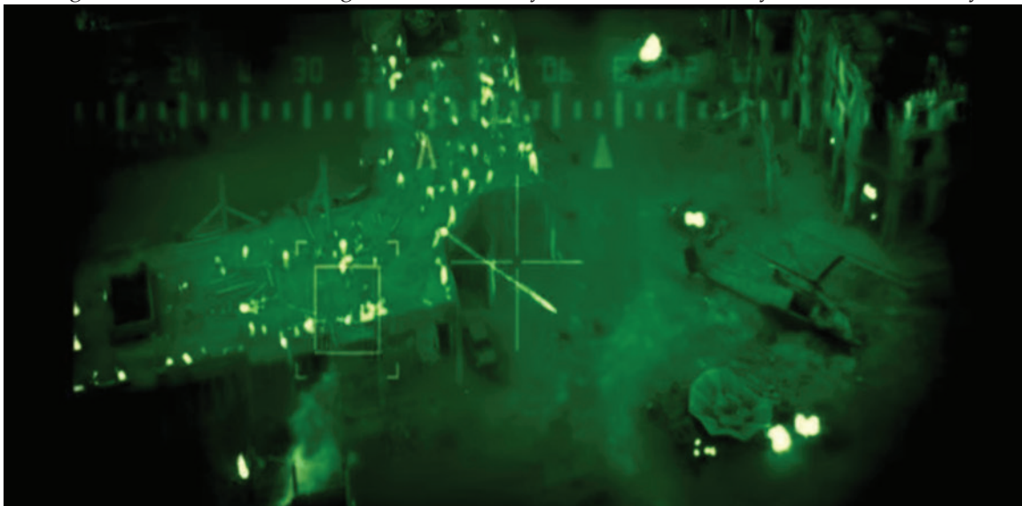
Figure 4. US air support spots the rooftop of Somali gunmen, shown as bright green spots, prior to strafing run.

In Ridley Scott's Black Hawk Down , the viewer is presented with a war narrative that exemplifies the means through which political violence is understood and given context. Throughout the film, while the viewer follows along the mission of US soldiers acting as a peacekeeping force in Mogadishu, the viewer is urged to emotionally connect to the many soldiers who carry out