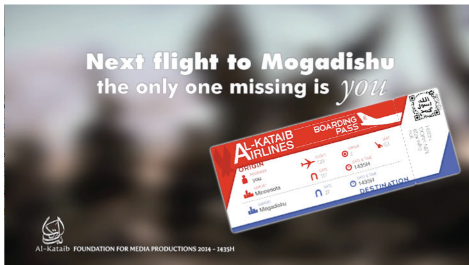
Figure 7. Screenshot from Al-Kataib video, “Mujahideen Moments 5.”

The masked speaker reads his poem from a sheet of paper, offering the listener an explicit choice: either make hijrah, or stay in the US and organize your own attacks, referencing the Westgate siege, where over seventy were killed, as a model. The film ends by displaying an image of an airplane ticket issued by Al-Kataib Airlines, flying from Minnesota to Mogadishu. The ticket bearer’s name is listed as “you.” and the date written as 1435, from the Islamic calendar (this is 2014 in the Gregorian calendar). Above the ticket, the screen reads, “Next Flight to Mogadishu the only one missing is you.”