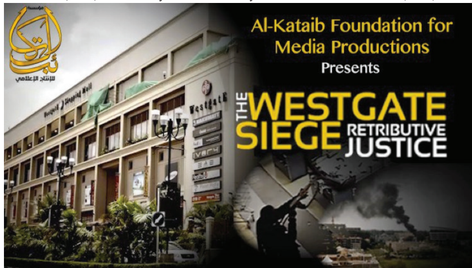
Figure 5. Al-Kataib advertisement, "The Westgate Siege Retributive Justice."